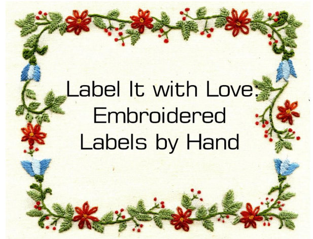
Embroidered label by Lynn Binney ready for special lettering

Variegated threads can add subtle interest. Before you start your project, test your chosen threads for colour fastness. SOME COLOURS (red in particular) DO RUN.