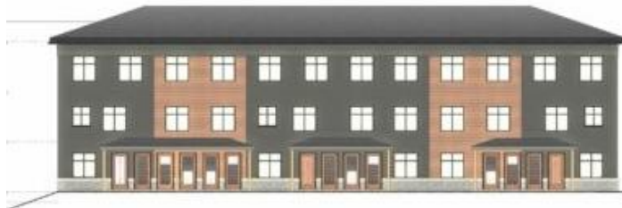
Artist rendering of Speedvale Commons build

First, a heartfelt thank-you to everyone who contributed to our Welcome 2 Waterloo initiative. Thanks to your generosity, creativity, and time, this project is now complete. Your quilts will bring warmth, comfort, and a sense of belonging to those beginning new chapters in our community. This was a remarkable achievement.