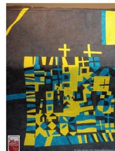
Speed Date with Improv