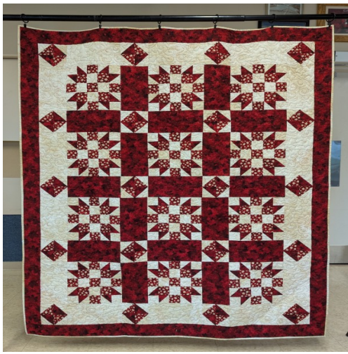
Quilt donated to Guelph Legion