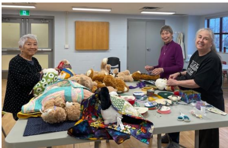
Putting together teddies

We gave twenty quilt wrapped teddies to Nonnina's Table, and fourteen quilt wrapped teddies to Holland Bloorview Children's Hospital. Three were given out on December 20 th , the day they arrived at the Hospital, and one special doggy stuffie went to a child who named the stuffie after the therapy dog that visits the hospital.