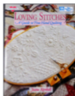
Loving Stitches: A Guide to Fine Hand Quilting, Jeana Kimball