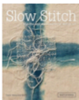
Slow Stitch: Mindful and Contemplative Textile Art, Claire Wellesley-Smith