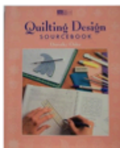
Quilting Design Sourcebook, Dorothy Osler