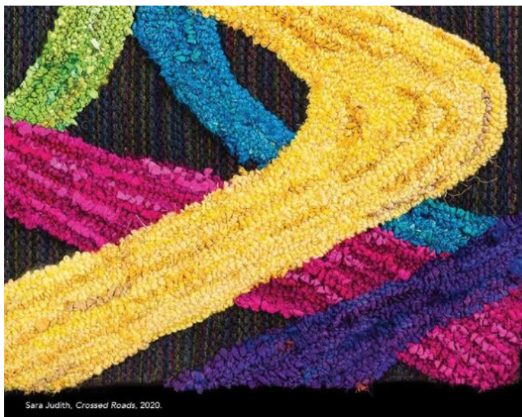
Sara Judith, Crossed Roads, 2020.